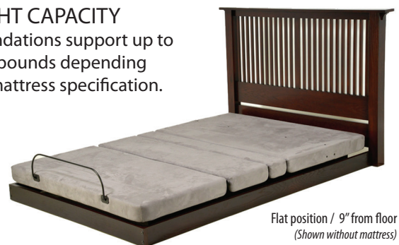
Flat position / 9" from floor (Shown without mattress)