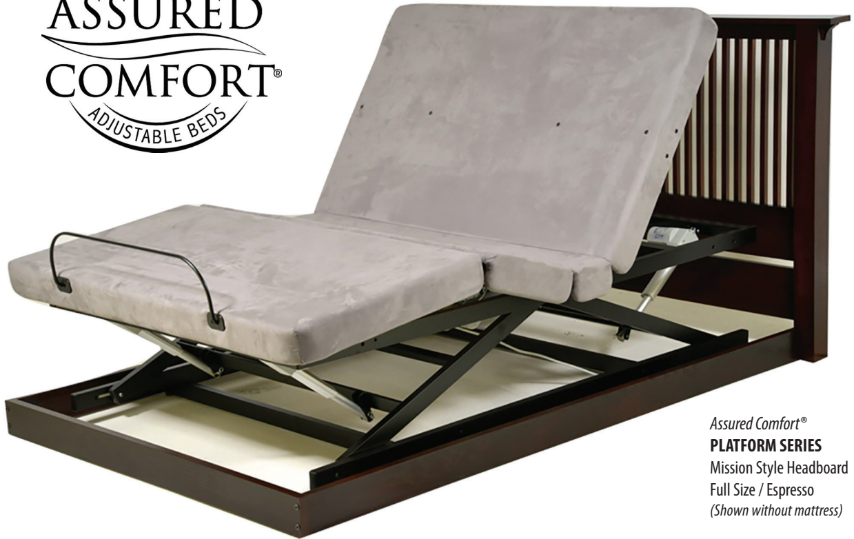
Assured Comfort® PLATFORM SERIES Mission Style Headboard Full Size / Espresso (Shown without mattress)