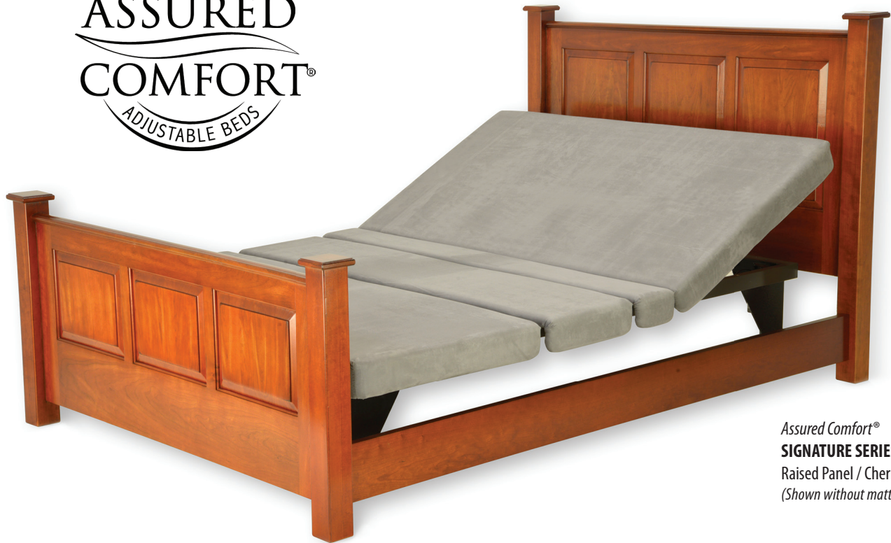
Assured Comfort® SIGNATURE SERIES Raised Panel / Cherry (Shown without mattress)