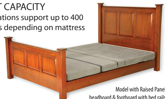
Model with Raised Panel headboard & footboard with bed rails (Shown without mattress)