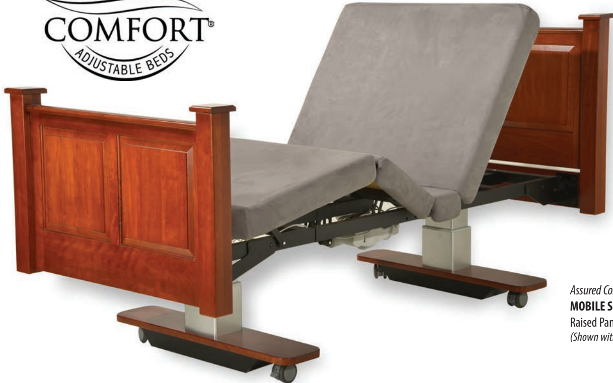
Assured Comfort® MOBILE SERIES / TWIN Raised Panel / Cherry (Shown without mattress)