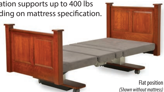
Flat position (Shown without mattress)