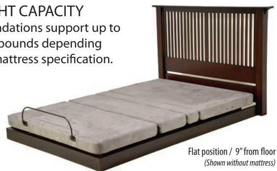
Flat position / 9" from floor (Shown without mattress)