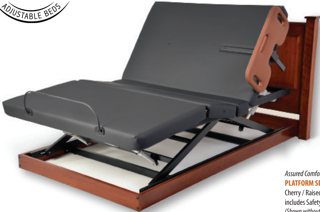
Assured Comfort® PLATFORM SERIES Cherry / Raised Panel includes Safety Rail option (Shown without mattress)